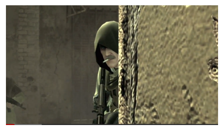
Figure 5: Old Snake in MGS4.