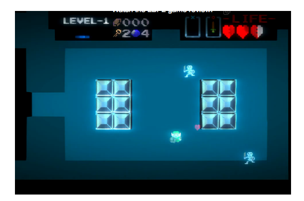
Figure 4: Legend of Zelda recreation built in LBP2. Image credits: IGNentertainment playing level built by Bluetonberry (http://www.youtube.com/watch?v=1gOx2U0tW-Q)

The question becomes: who am I in LBP? And I answer: in LBP I am an all-powerful creator, a logical thinker, a designer of experiences, a crafter of explosions. And sometimes I am just a player, an explorer, a frequently-skewered sackperson who gives up in frustration and hurls the controller across the room. Everything I see, do, or experience, I can re-create in my own space (my "moon"), and improve upon, modify, shift—and share with the millions of other adorable little sackpersons all over the world. And while they frequently just tell me, "THIS LVL IS DUMB!111," I am still the god of their experience (and I can tsunami whenever I want to).