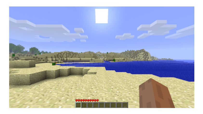
<u>Figure 1</u>. A typical "opening scene" in Minecraft , with the player spawning on a beach in a newly-generated world.

Note that, in Figure 1, there are a number of easily-recognizable gaming interface elements at the bottom of the screen. There are hearts — usually indicative of health in first-person games and third-person adventure games (e.g., The Legend of Zelda series; Chess, in preparation). Below the hearts, there are a number of empty "slots" — in many first-person games, a location where one would pick and choose between a variety of weapons. The game's visual aesthetic extends to the game's representation of the player, with the block on the right side of the screen being an image of the player's right hand/arm.