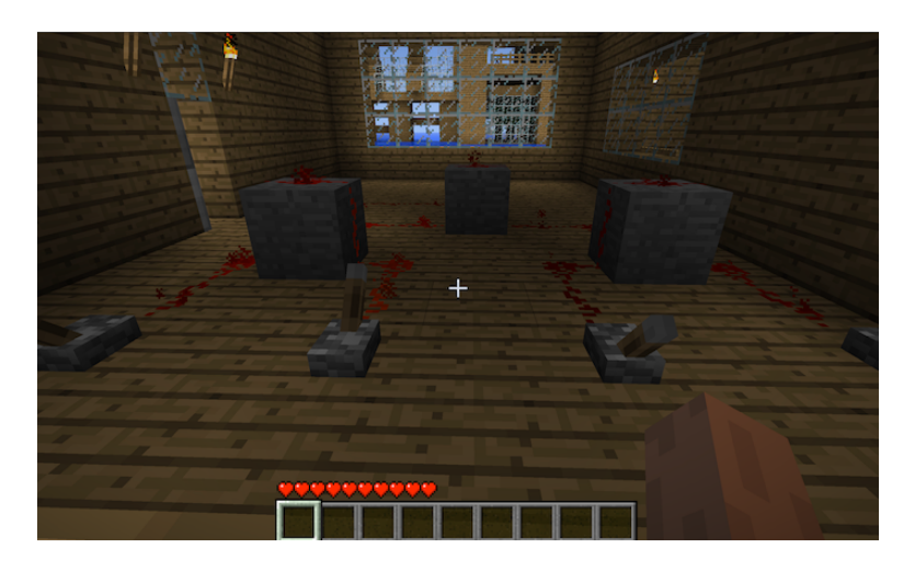
Figure 4. A screenshot of Circuit Madness , a game implemented within Minecraft to teach players basic logical operators.

But, for Circuit Madness , we again fall back on the space being used as, more or less, a construction set to develop a new experience. Nowhere do the survival mode elements of the game have consequence, and, as an instructional environment, there are impediments that can hamper such a game's usability — for example, left-clicking on a switch will punch and destroy it, as is the norm for all Minecraft objects, meaning players are forced to right-click to progress through the game. Though the potential exists for both Levin's experiments and games such as Circuit Madness to create transformative learning experiences, they utilize Minecraft as a jumping-off point. Are there other experiences that can more fundamentally capture survival/construction dynamic of Minecraft and still aim to do something different than the original game?