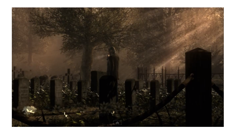
Figure 2: The prologue graveyard scene in MGS4.

extended cut scenes, particularly one near the conclusion that always brings me to tears (see Figure 2).